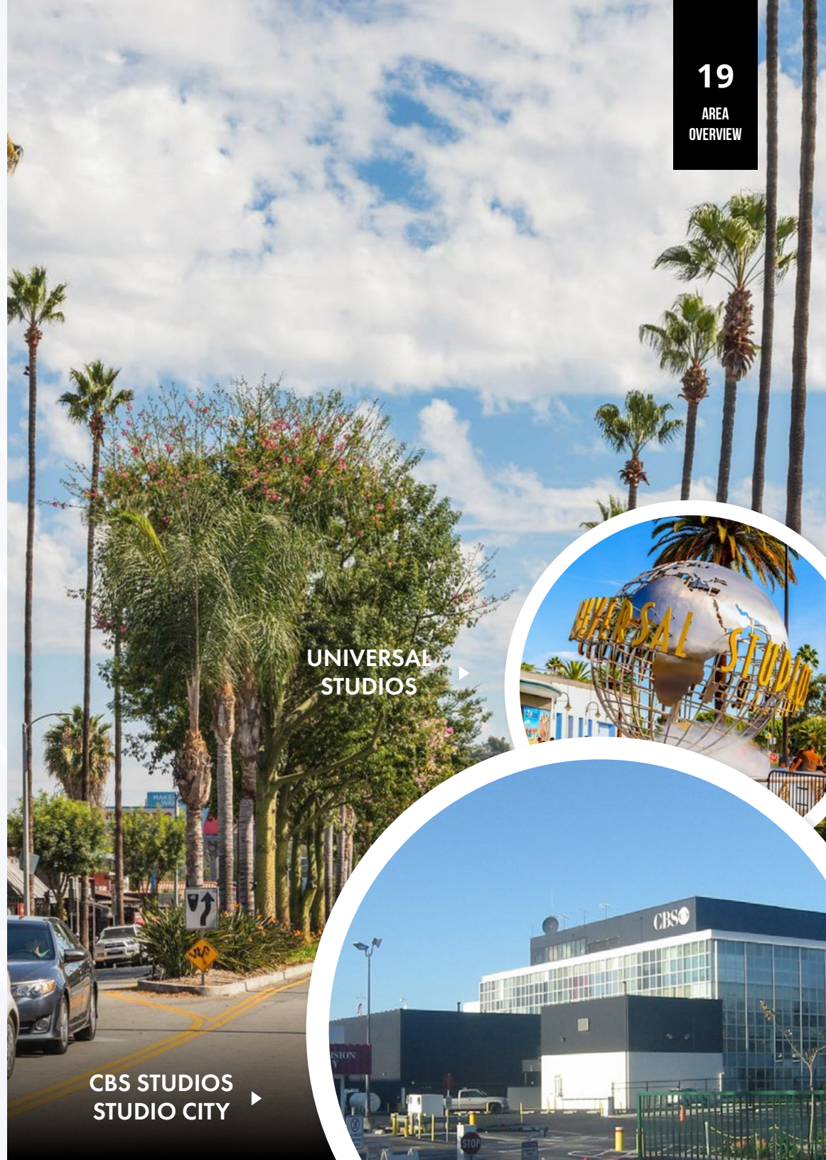
UNIVERSAL STUDIOS ▶

11825 VENTURA BOULEVARD STUDIO CITY, CA 91604