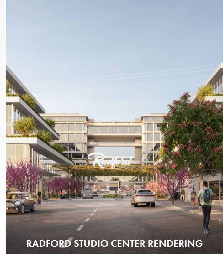
RADFORD STUDIO CENTER RENDERING

Less than 0.4 miles to the west of the property is the Silver Triangle, one of Studio City's most sought after neighborhoods, beginning at the intersection of Laurel Canyon and Ventura Boulevard. This area is known not only for its homes, but also its walkable retail environment with popular shops, restaurants, and other retailers like Vons, Trader Joes, CVS, Urban Outfitters, Mendocino Farms,