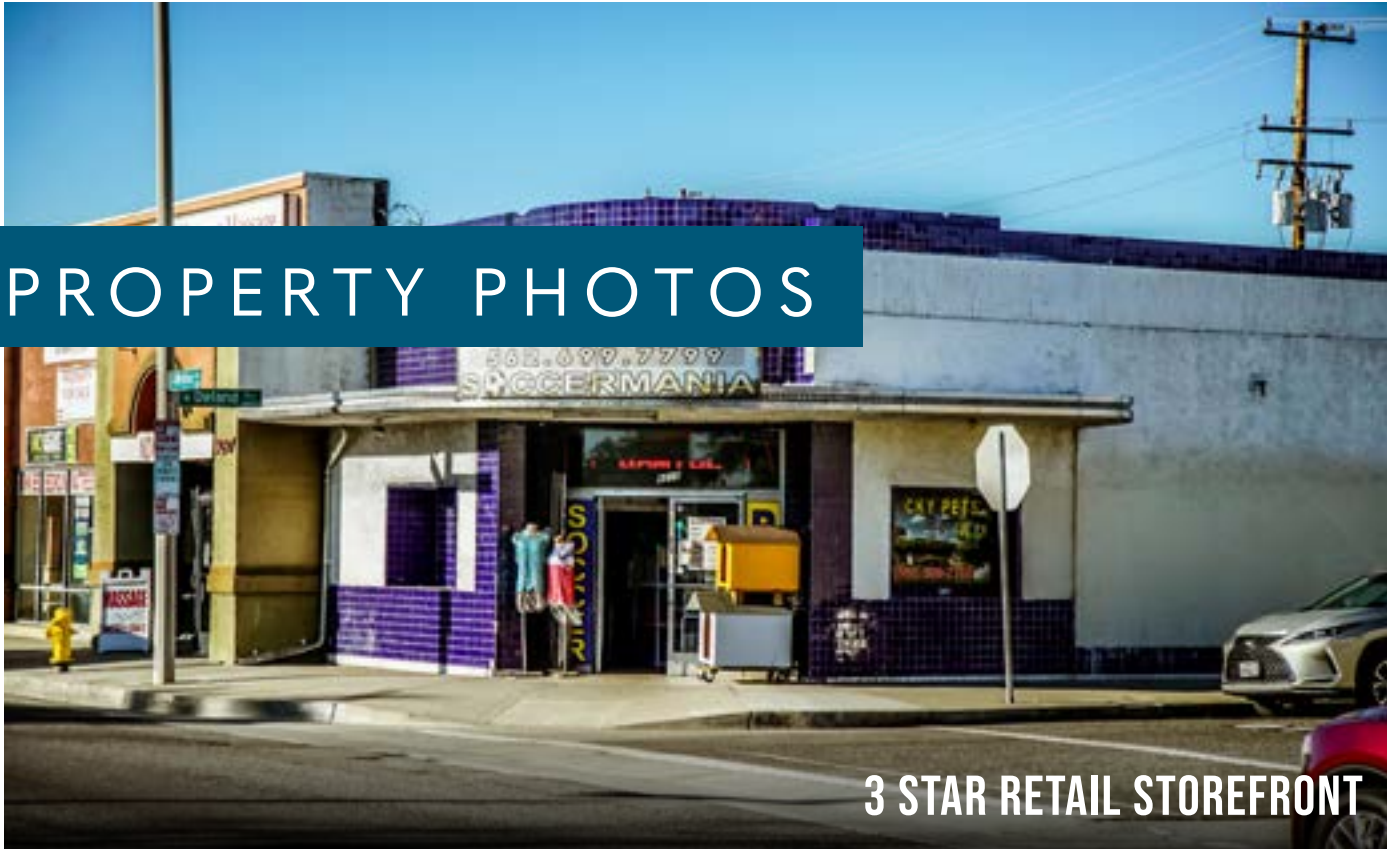
3 STAR RETAIL STOREFRONT