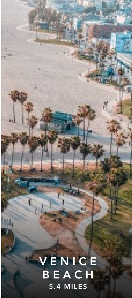
VENICE BEACH 5.4 MILES