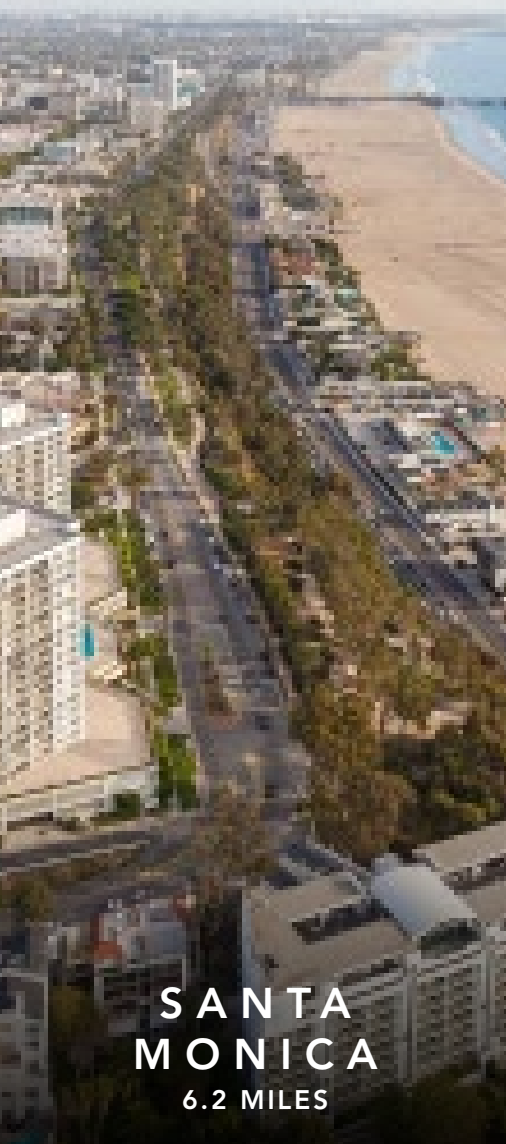
SANTA MONICA 6.2 MILES