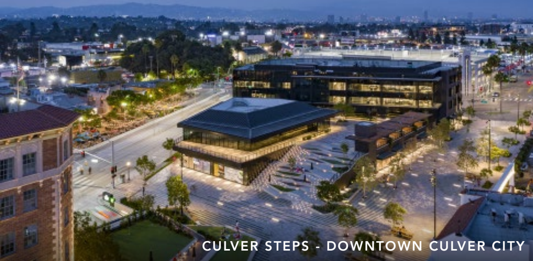
CULVER STEPS - DOWNTOWN CULVER CITY