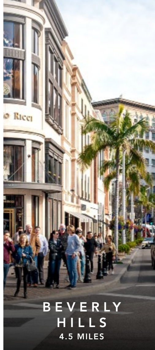
BEVERLY HILLS 4.5 MILES