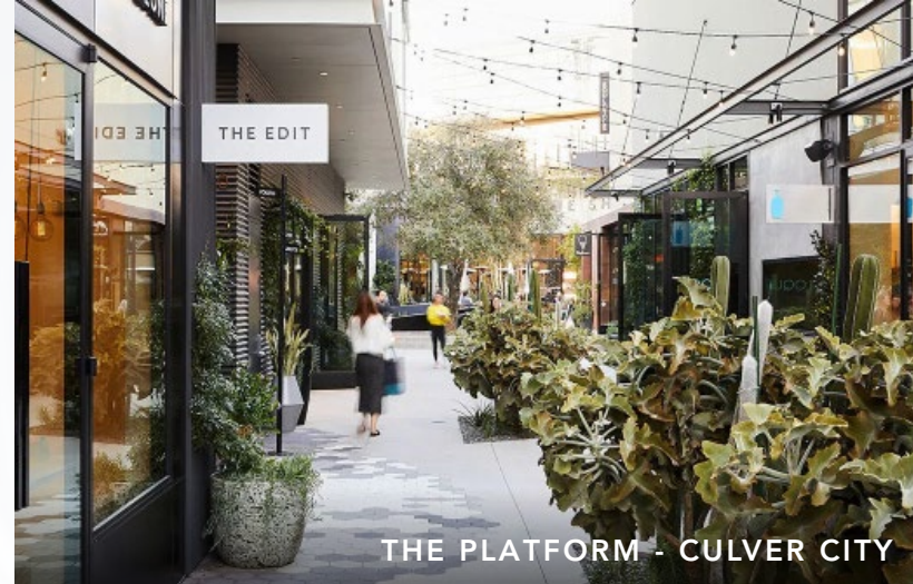
THE PLATFORM - CULVER CITY