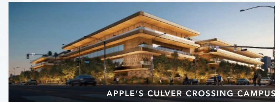
APPLE'S CULVER CROSSING CAMPUS

The submarket has seen considerable growth with retail rents surging 30.3% higher than they were a decade ago. The subject property also benefits from a dense population in the immediate area, with 53,683 people within one mile of the subject property, 288,941 people within three miles, and 836,510 people within five miles. The immediate submarket boasts an average household income within one, three, and five miles is $106,505, $121,227, and $119,882, respectively, with a median income within one, three, and five miles $84,142, $91,359, and $89,324, respectively. There are over 25,247 households within one mile of the subject property, and over 123,587 households within three miles. The median home value in the immediate area is $1,057,049.