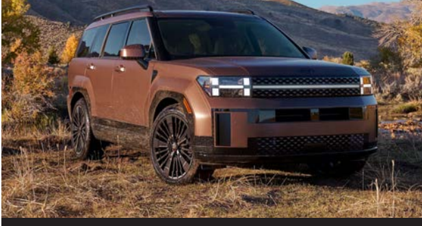
Santa Fe Hybrid The Epically Capable Hybrid SUF