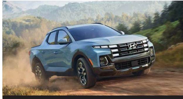
Santa Cruz SUV Versatility & Truck Utility