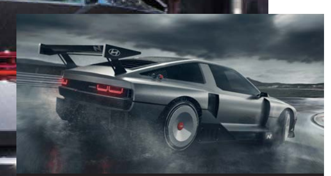
N Vision 74 Hyundai Hydrogen Powered Performance

Hyundai Motor America, the North American subsidiary of Hyundai Motor Company, was established in 1986 and serves as the primary distributor of Hyundai vehicles in the United States. Headquartered in Fountain Valley, California, Hyundai Motor America is dedicated to providing innovative, reliable, and affordable vehicles that meet the diverse needs of American consumers. The company offers a comprehensive lineup of vehicles including sedans, SUVs, electric vehicles, and an expanding line of hydrogen fuel cell vehicles.