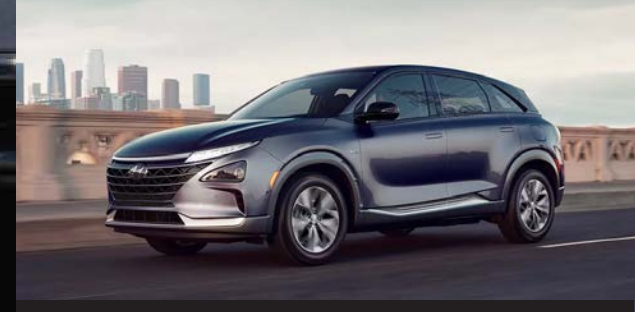
NEXO Fuel Cell Hydrogen Powered SUV