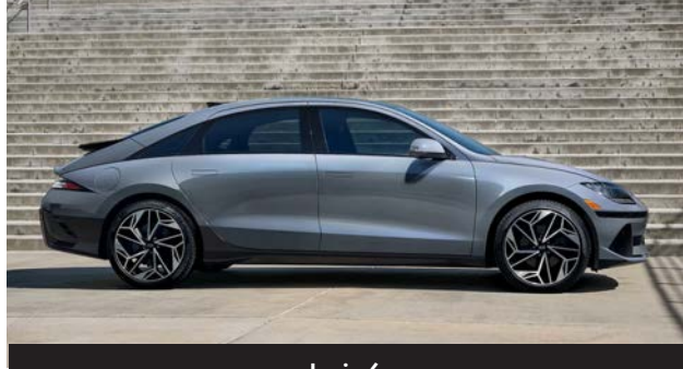
Ionic 6 A Breakthrough Electric Sedan